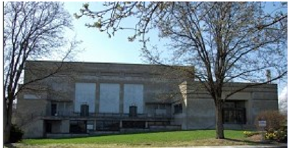
Dunham Hospital (Tuberculosis)