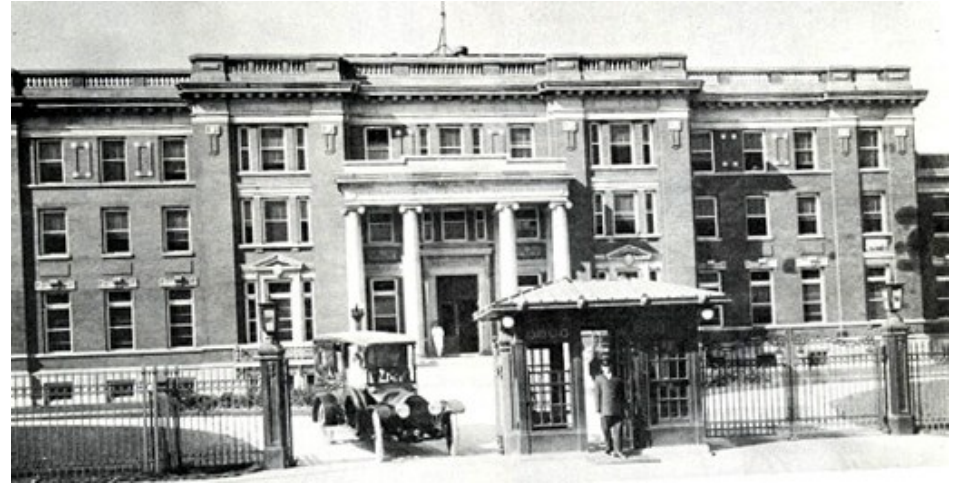
University Hospital Administration Building

Over the years the Federation's outreach ministries have served at hospitals, at nursing homes, at a TB sanitarium, at the old County Home, at a rehabilitation facility, on university campuses, at a drug rehab center for US military vets, and serving the homeless.