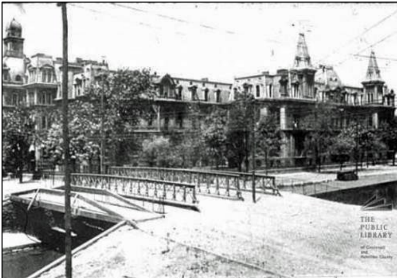
Longview State Hospital

The Federation of Lutheran Churches of Cincinnati and Vicinity began in 1921 when LCMS churches in Cincinnati wanted to reach out together with Jesus' love to the hurting and lost people in the surrounding community.